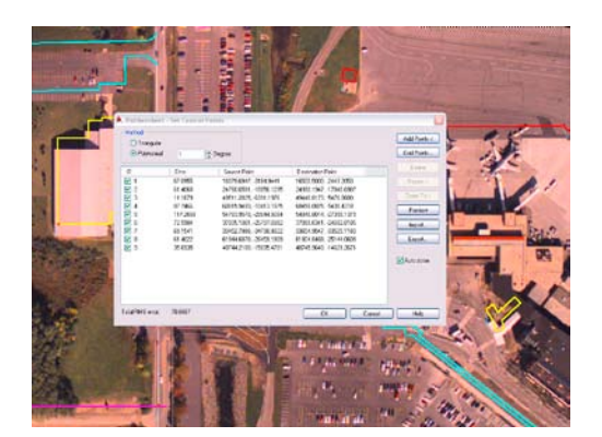
Use correlation tools such as the unlimited point rubbersheet function to align aerial photos to drawings.

Recognize machine and hand-printed text and tables on raster images to create AutoCAD text or multiline text (mtext) automatically. Use interactive verification to correct results with dictionary matching. Save manual data entry time and improve accuracy when converting scanned documents with a lot of text.